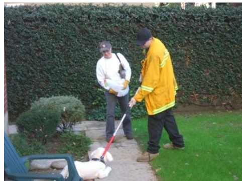
Search and Rescue