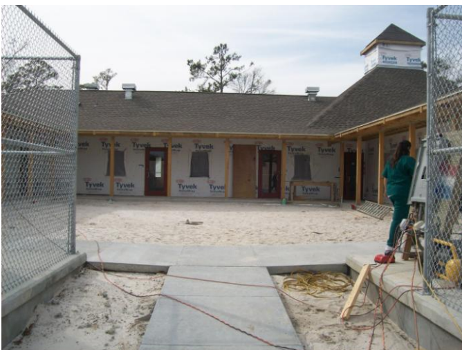
Courtyard between kennels

Take a look at the progress that has been made on the new animal control shelter currently under construction in Slidell.