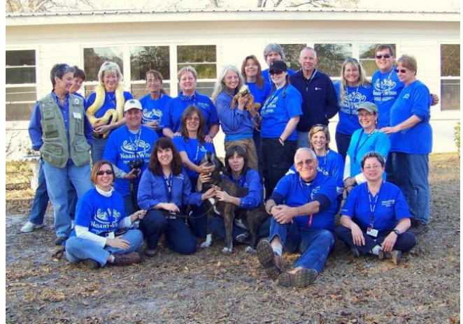
Class of 2010 Group Photo