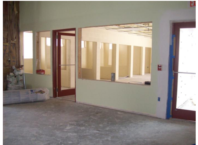
View from Lobby to Cat Room

A lot of progress has been made since the last update in December 2009. The anticipated opening date is now set for the April timeframe.