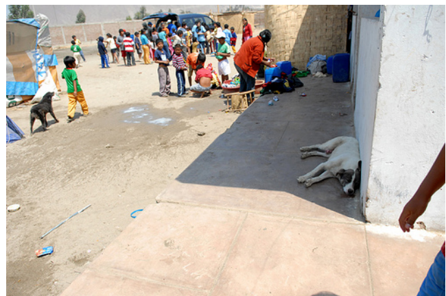
A typical tent city.