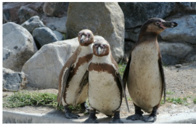
Penguins at the Ica Zoo have no water.

information or activity is reported on their websites. As the weeks progress several agencies begin reporting on their activities, conducted by Peruvian based local charities associated with said agencies. The Peruvian Ministry of Health is coordinating animal relief efforts through the Peruvian Association for the Protection of Animals. ASPPA, nor other volunteer teams, ever hear about or observe these other