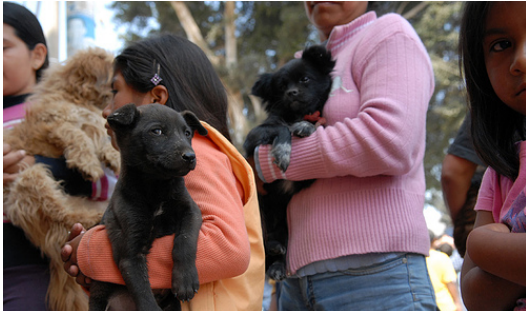
Waiting in line for treatment.

Pisco, Pisco Playa, Chinchá, Guadalupe, Little Guadalupe and Las Molinas.