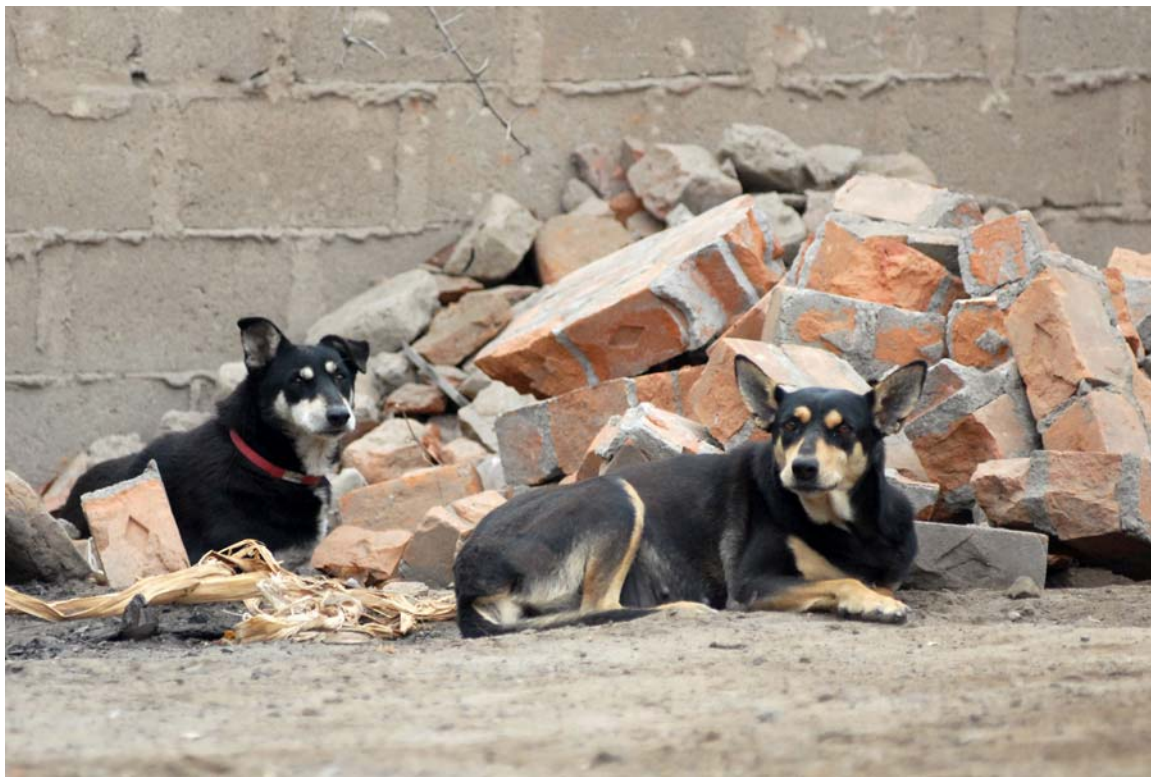
A red collar indicates the animal has been spayed or neutered.

Best Friends Animal Society returns to the region with a plan to sustain the animal welfare effort. Amazon CARES plans to return with more veterinary volunteers once Best Friends is ready.