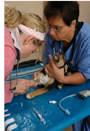
CAAT Veterinarians at work.